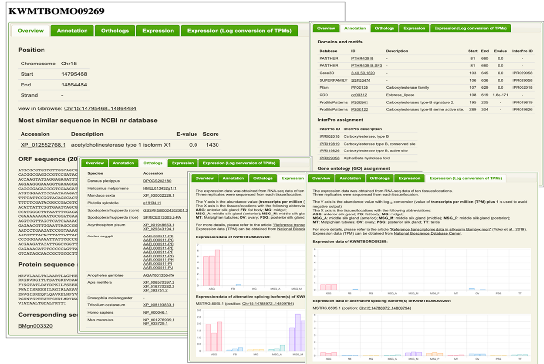
Figure 2. An example of description page. The information of chromosomal positions, nucleotide and amino acid sequences, functional annotations, orthologs and expression patterns [original transcripts per million (TPM) values and log 10 conversion of TPM values with an offset of 1] are shown.