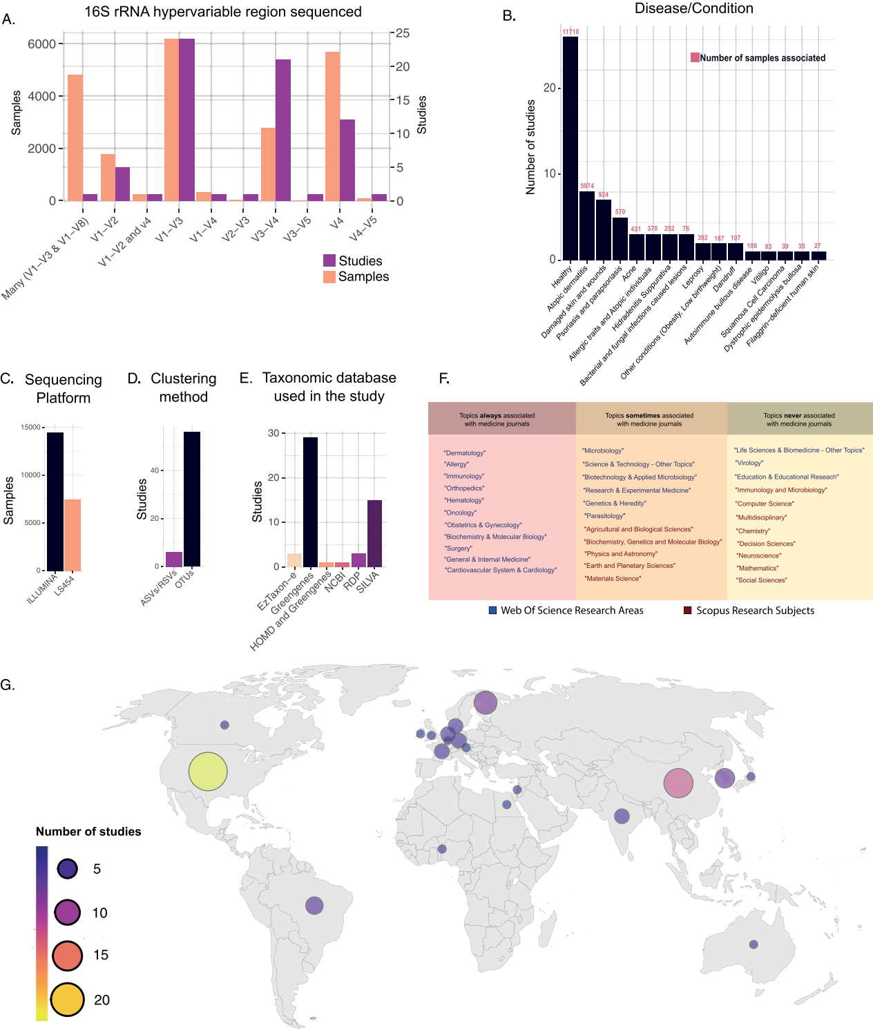
Figure 3. (A) Number of samples and studies that used specific 16S rRNA hypervariable regions in Data Frame 3. (B) The number of studies and samples for each disease/condition investigated in Data Frame 3. (C–E) Frequency of use of the different sequencing platforms (C), clustering methods (D) and taxonomic databases (E) in Data Frame 3. (F) Table showing the WoS research areas and Scopus research subjects that described the scientific journals in which the studies of Data Frame 3 have been published. The research areas/subjects are divided into three boxes depending on how often they were associated with the Scopus research subject 'Medicine'. Going from left to right are shown the research areas/subjects that were always (left), sometimes (center) and never (right) associated with the Scopus research subject 'Medicine'. (G) Geographical distribution of the studies included in Data Frame 3.

other conditions such as obesity and low birth weight (two studies). Overall, 26 studies collected samples from healthy human skin (in Data Frame 3, column 43 'disease/condition').