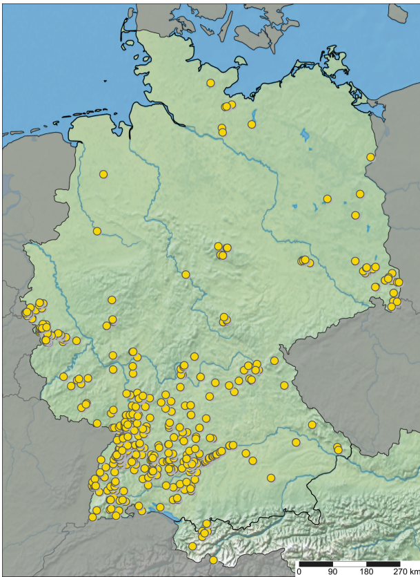
Figure 1. Sampling sites with spider assemblage data available in ARAMOB, with data from 26 October 2023.

Alt Text: A map of Germany and Austria with dots marking the sampling sites available for analysis in ARAMOB.