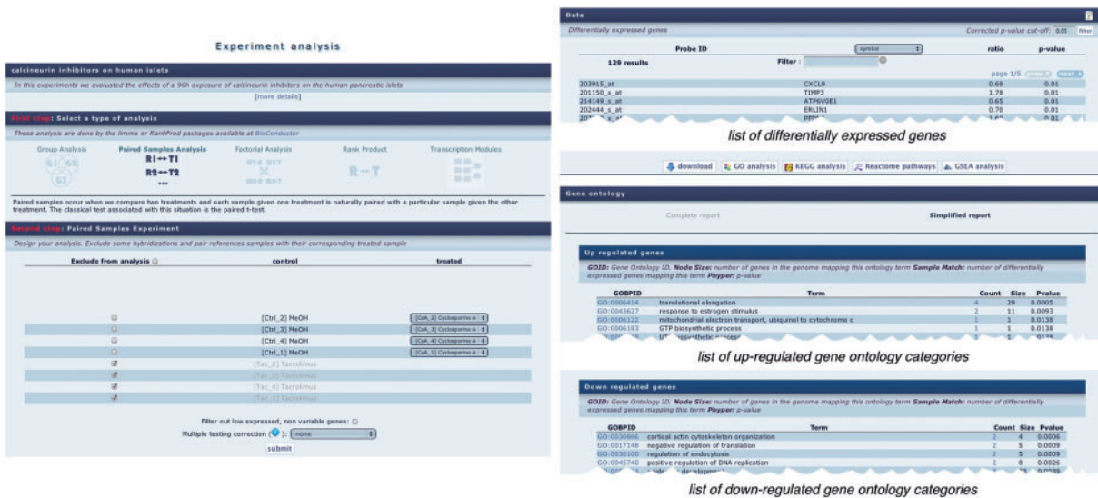
Figure 2. Experiment analysis. The order of the boxes reflects the flow of analysis steps. From top to bottom and left to right, the experiment name and description, the selection of the type of analysis, the form to describe analysis design (for this example, paired samples design), the list of differentially expressed probes with their relevant gene symbol, expression ratios and P -values of differential expression and the list of altered GO categories is provided.

or pathways with the relevant P -values for enrichment. In addition to these enrichment analyses, a user can also perform Gene Set Enrichment Analysis (GSEA) (14) using ordered gene lists to identify enriched pathways or functionally related groups of genes. The gene lists for GSEA can either be selected from MSigDB (14) or imported by the user.