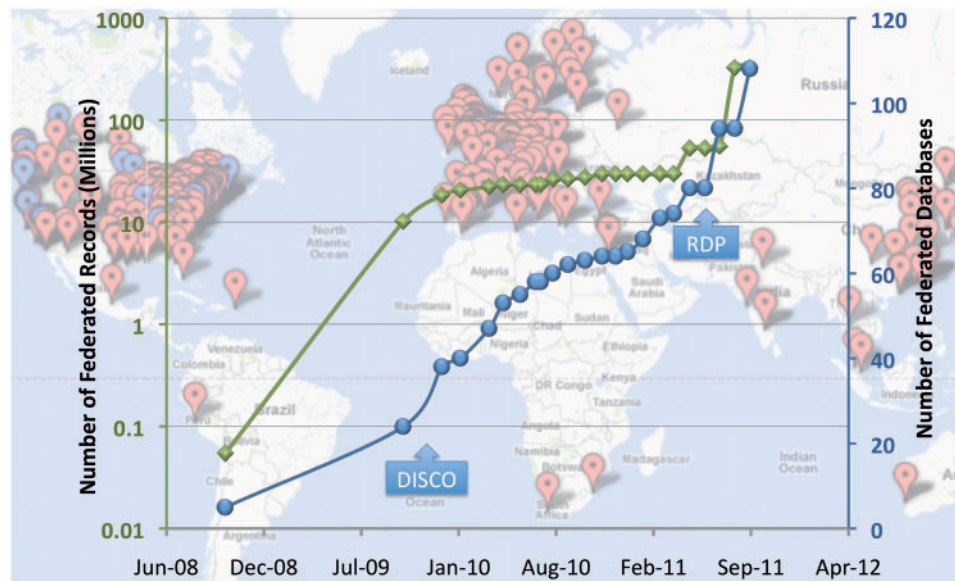
Figure 1. NIF Resource Landscape. Background: each point on the map represents a global location that houses one or more resources registered with the NIF (via NeuroLex). Red points represent NIF registry entries and blue points represent databases and data sets incorporated into the data federation. Foreground: the blue line represents a plot of the number of federated data sources over time, and the green line represents the number of records in the NIF Data Federation over the same time (note these records come from only the blue dots and that the scale is logarithmic). The DISCO protocols and automated resource crawling were integrated into NIF system function in November 2009 and led to a growth of NIF holdings and in mid 2011, significant enhancements of the DISCO protocols allowing for enhanced automation of data ingestion, as well as the current resource discovery pipeline (RDP) were implemented.