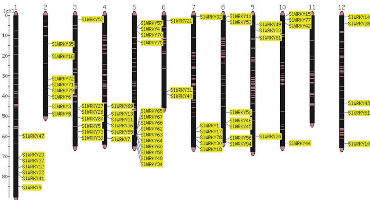
Figure 1. Map viewer. Chromosome distribution of the 82 members of the tomato WRKY gene family. The shown locations are based on the physical position of each corresponding genome gene model, based on the ITAG2.3 annotation of the tomato genome.

Annotation of functional information to gene families. Functional annotation of genes based on gene family information can increase curation efficiency significantly because many of the gene family members will share some of the functional characteristics, and if the appropriate user interfaces are available, pertinent annotations can be propagated to all members of the family in one editing step. In the SGN system, the gene family detail page allows ontology-based annotations on a gene family basis, which are then propagated to each member of the family. Each