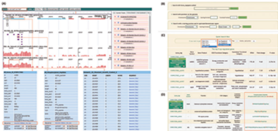
Figure 3. Screenshots of the Genome Browser, transcriptomics and proteomics interfaces. (A) Overview of the Genome Browser and an illustration of its application in browsing of genome, transcriptomes and proteomes; (B) three strategies to quickly search regions of interest using the Genome Browser; (C) check box of up- or down-regulated genes under different conditions, and information table of the differentially transcribed genes, including biological functions, Cyanobase functional categories, COG categories, fold changes and external links; (D) an information table of proteomic data.