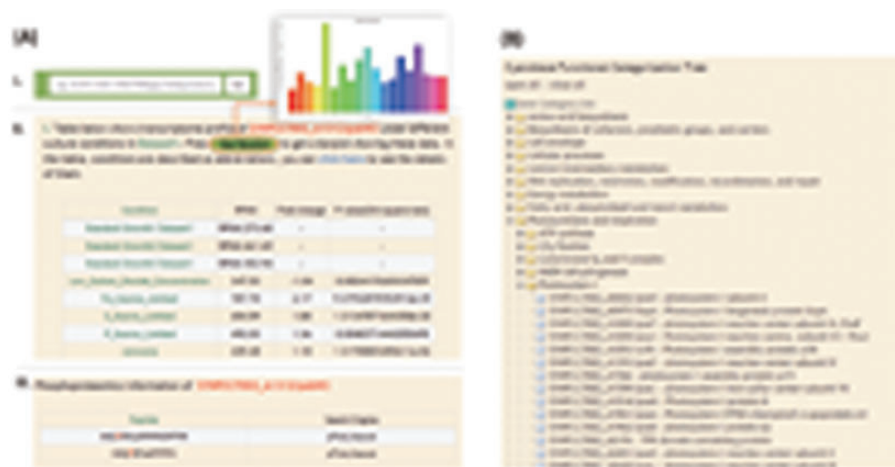
Figure 2. The search module and Cyanobase functional categorization tree integrated into the CyanOmics interface. (A) The search box and the extended search results page; (B) structure of the Cyanobase functional categorization tree on the website and an illustration of the drop-down list of the genes belonging to the corresponding category.

Browse main page opens a new browser window comprised of all the dataset tracks integrated into the CyanOmics database. An overview of the histogram navigator—Abrowse-mode Genome Browser—is shown in Figure 3A.