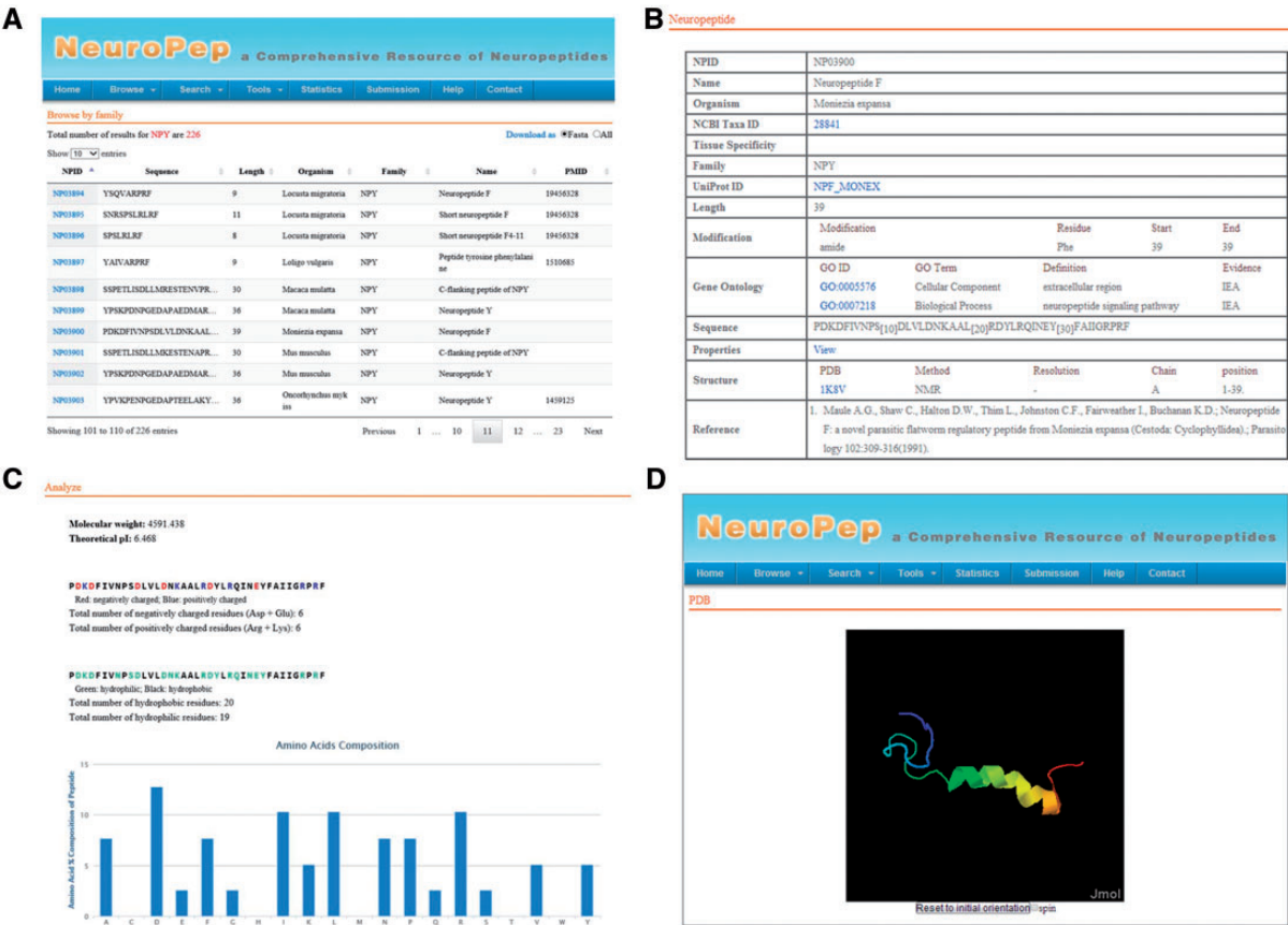
Figure 1. An overview of the user interface of NeuroPep. (A) The browse output of NPY neuropeptide family. (B) An example of an entry NP03900 of the NPY family. (C) The properties page of the entry NP03900. (D) The structure view page of the entry NP03900.

Name: The name of the neuropeptide which was collected from the literature or UniProt.