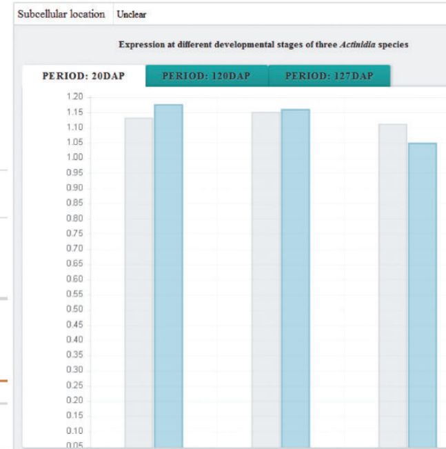
Figure 2. Screenshot of the detailed information of putative proteins, including basic information, functional description, biological pathway, molecular structure, predicted PPI, protein expression and related publications.

chromosome sequences are provided in Generic Feature Format 3 (GFF3) format, along with FASTA files of each chromosome sequence. Lists of data files for previous genome release are also available on the ftp site. In contrast to the ftp site that provided genome-wide datasets, a variety of gene functional description, transcriptome data and protein annotation files are provided in the form of flat-files. All data are hosted and accessible publicly. Users can also