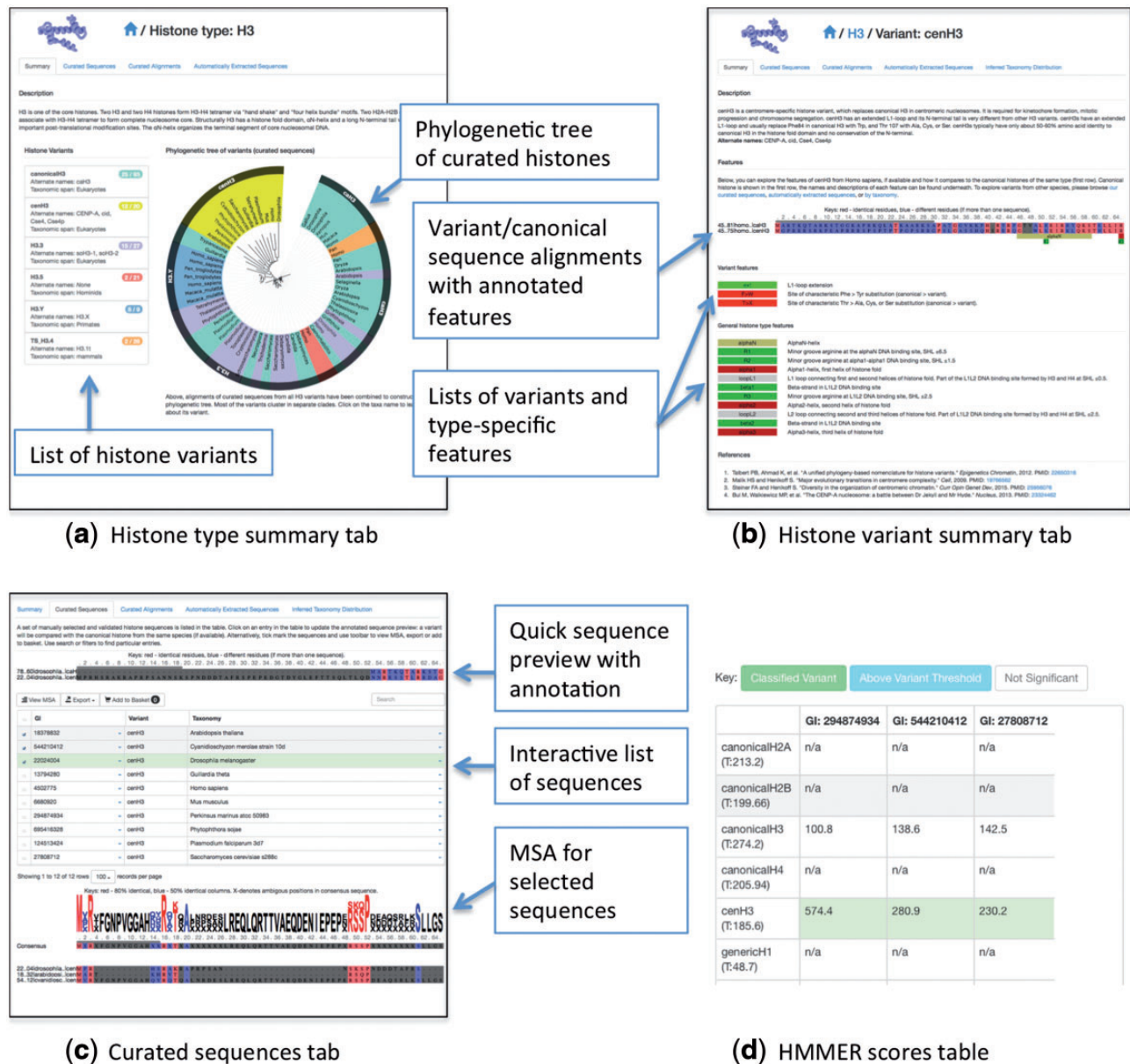
Figure 3 A summary of HistoneDB 2.0 web site. (a) information page for a given histone type, (b) a summary page for a typical histone variant, (c) ‘Curated sequences’ tab of the histone variant page, (d) a table view of HMMER scores used to classify the selected sequences from the automatically extracted set (access via ‘Advanced’ menu, ‘Score against all HMMs’ button).

search allows the user to find sequences based on the keywords while an advanced option provides opportunities to look for specific histone types with particular sequence motifs and to show only unique sequences from a given organism. The quick search field is also implemented on the top of the table while viewing any list of sequences. In this case the search is limited to the content of the respective table. Another helpful feature of the website is ‘Basket’. While viewing a set of sequences, the user can mark entries of interest in the table and press the button ‘Add to basket’. The cumulative list of sequences can be then viewed at the basket page accessible from the website header.