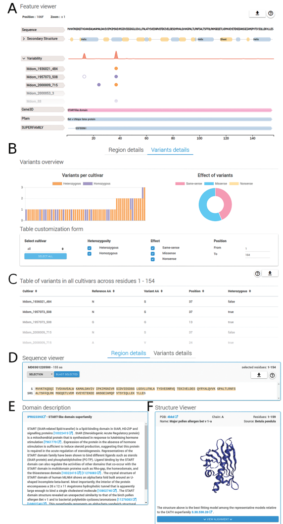
Figure 2. Region and variants description. The detailed region and variants description for PhytoTypeDB entry MD03G1220500 is shown. (A) Feature viewer. The sequence feature viewer is fully interactive, allowing to zoom and to select regions of interest; showing sequence, secondary structure, variability and domain annotations. More details can be visualized for secondary structure (helix, strand, coil propensity) and variability tabs (open in the figure) by clicking on their respective tabs. Different cultivars are shown, one per row, with variant sites indicated by empty (same-sense) or full circles (missense) of different colors (purple for heterozygous and gold for homozygous). (B) Variants overview showing a histogram for the distribution of variants for each different cultivar. The effect of variants is shown as a pie chart on the right side. A form allows to customize the variants to be shown by selecting cultivars, type of variant, effect and limit positions along the sequence. (C) Variants for the selected sequence region are shown in a detailed table containing the cultivar name, reference and variant amino acid type, position and zygosity information. (D) Sequence viewer showing the sequence region selected in the feature viewer. Sequence searches using BLAST from the selected sequence can be performed by clicking on the corresponding button. (E) A domain description from InterPro is shown after it is selected in the feature viewer. (F) Whenever a GENE3D domain is selected in the feature viewer, a separate and interactive structure viewer shows the PDB file with the most similar structure. Details about the PDB file are shown and the sequence to structure alignment can be visualized by clicking on the corresponding button.